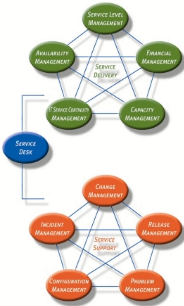
Diagram featuring Service Support and Service Delivery processes, as well as the Service Desk function.

ITIL's IT Service Management process model enables organizations to link together eleven key disciplines required to support and deliver effective IT services. ITIL describes how these disciplines are related to wider business issues. This approach has allowed thousands of IT organizations to improve their credibility and effectiveness, and reduce costs.